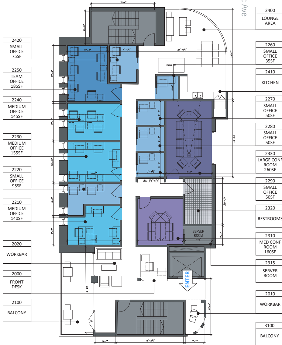
⌚ SECOND FLOOR